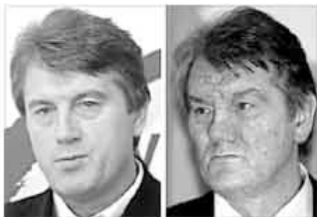
The picture combo shows Viktor Yushchenko in file photos dated March 28, 2002, left, and Dec. 6, 2004, right. The Ukrainian opposition leader and presidential candidate's mysterious illness that scared his face was caused by dioxin poisoning, doctors said Saturday in Vienna, Austria.

London (NYT) — Tests done at a hospital in Vienna, Austria confirmed that Viktor A. Yushchenko, the Ukrainian opposition candidate, had been poisoned with dioxin , doctors there said Saturday, providing an explanation for a broad array of painful and disfiguring conditions that plagued him during the past three months of the presidential campaign. Dioxin, a waste product of various industrial chemical processes, is a highly toxic chemical that remains in the body for years after exposure , so doctors were able to test their patient Friday, long after the near-fatal poisoning occurred. Initially the poison often produces severe abdominal pains, nausea and vomiting — and, in the long term, very high doses can produce the kind of skin